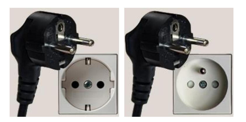
CEE 7/7 plug fits both sockets shown.