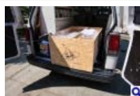
Speedster Crate The shipping crate is 82kg

The boilers feature the latest go-to technology in espresso: the 3.5 litre steam boiler is fitted with a heat exchanger to provide pre-heated water for the smaller 2.3 litre brew boiler. This technology was initially developed for the GS/3 to help with power consumption but it was also found to increase temperature stability, especially shot-to-shot-to-shot performance in all machines. Along with the Speedster, some of the most technologically advanced machines in the world feature this