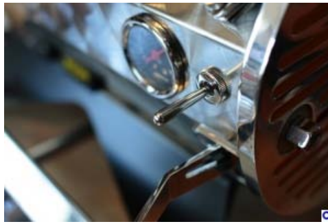
Rocker Switch for Hot Water This is the up / down rocker switch for delivering two temperatures of hot water.