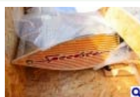
First Look First glimpse of the Speedster during unpacking.