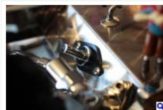
Preinfusion Piston Piston is fully engaged (sticking out of the machine) showing full preinfusion.