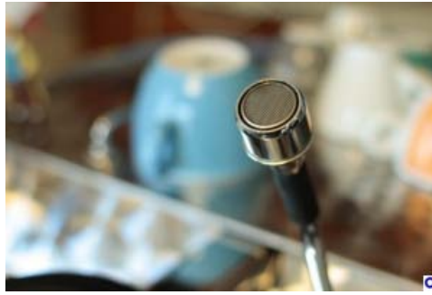
Hot Water Tap Flipped up for photographing, the hot water tap's wide articulation of motion and well engineered flow dispersion is top of the line.

I focused on the hot water delivery to prove a point about this machine and about the person who builds it: Kees van der Westen is a details man. Pretty much every aspect of this machine, from the aesthetics, to the usability, to the technology inside shows a supreme attention to detail by an artist and engineer who "gets" modern day espresso. This isn't a machine designed by someone who's building for 10,000 units sold in Spain, or 25,000 units sold in China, where niceties such as temperature stability, steaming ability or manual controls are not valued much. This is machine designed by someone who gets what the modern day professional barista demands from a state of the art espresso brewer. It shows in every single aspect of the machine's design and function.