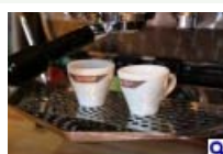
Ltd Edition Cups Very limited edition cups that come with the machine.