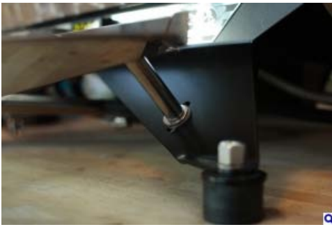
Mounting Legs, Adjustment This is the drip tray mount (there's one on each leg up front). It can be slid up or down to give an extra inch in tray height.