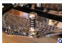
Kees' Tamper A custom-height tamper included with machine.