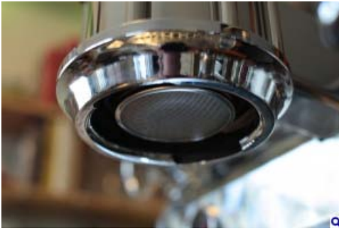
Dispersion Screen The screwless dispersion screen; note the centre doesn't have the hole-perforations - that is to further disperse water (which can drain in the middle from the dispersion block)