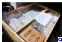
Inside Inside is the machine, accessories, pump, water softener.